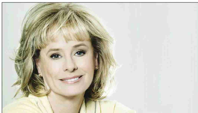
Kathy Reichs is the author of "Seizure: A Virals Novel." She's also the creator of the TV series "Bones."